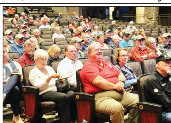
More than 200 people attended the Target Range meeting at

The Gun Club now boasts at least 414 members and can be found online at UnionCountyGunClub.org or