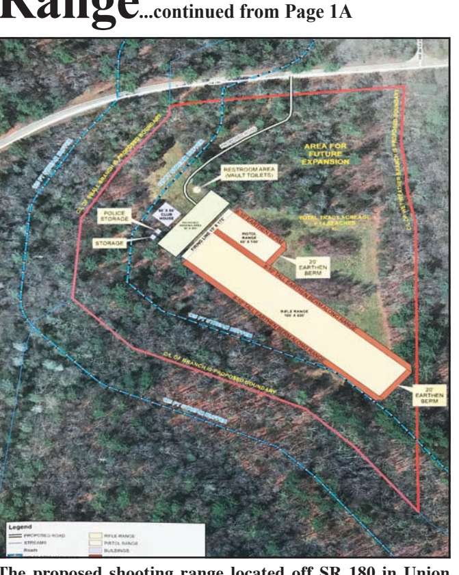
The proposed shooting range located off SR 180 in Union

comments to us, make them specific, put some thought into them. And understand that, when you do, they're part of the public record.'