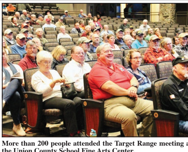
the Union County School Fine Arts Center.

the proposed site off SR 180. "The county will be continuing to look for a spot